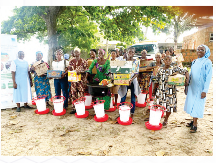
Strengthening Livelihood: Caritas Nigeria Poultry farming initiative in Badagry