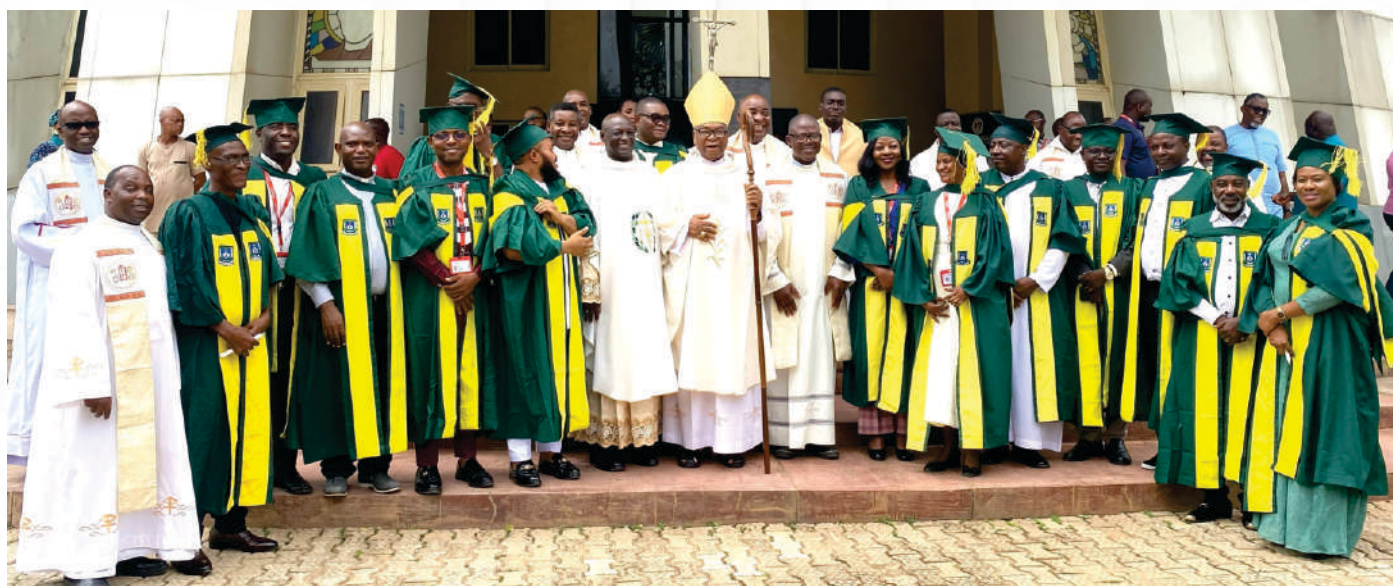
Inauguration of Pioneer Trainers of the Catholic Social Teaching Program

Commemoration of the World Refugee Day in Mubi Adamawa State - Pg 18