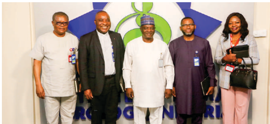
Caritas Nigeria's Senior Management Team's Courtesy Visit to IHVN