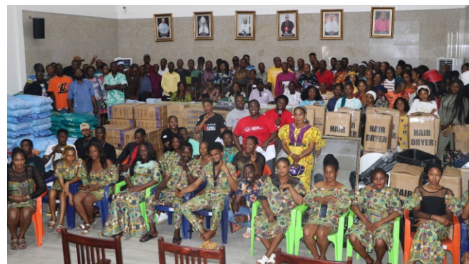
STEM-supported beneficiaries who were trained and received trade start-up tools for various skills