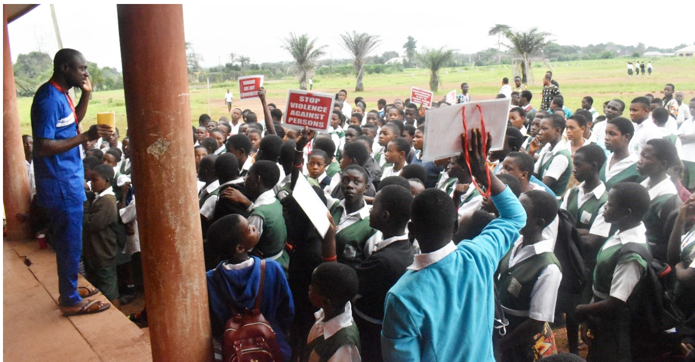
Sensitization on Anti-human trafficking and irregular migration at St. James Grammar School, Afuze in Owan East LGA, Edo State