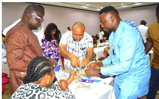
Clinical Mentors' training in Enugu State