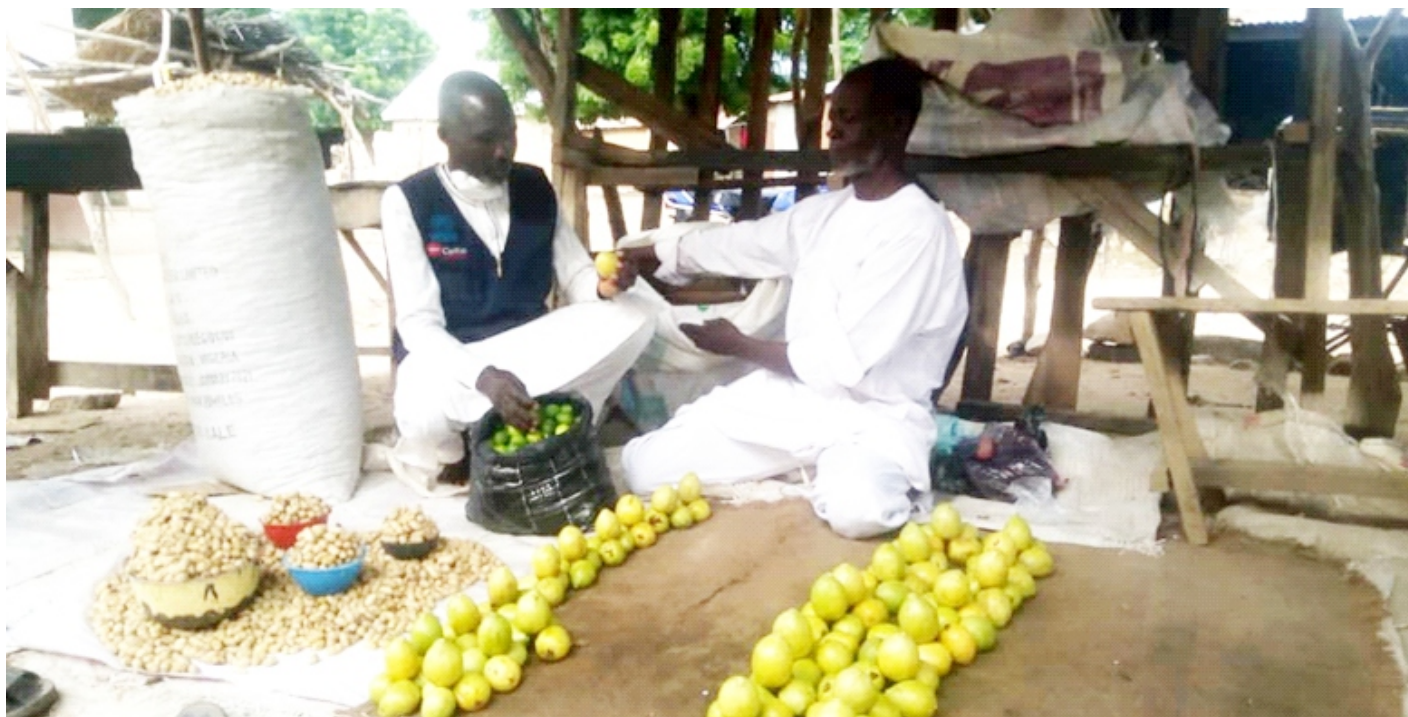
A Caritas Nigeria staff with an active person of concern who was supported with a cash grant of 30,000 NGN for an income-generating activity (IGA) in Vuragwadla community, Madagali LGA, Adamawa State

The United Nations High Commissioner for Refugees (UNHCR) project aimed at improving protection and assistance to persons of concern internally displaced persons (IDP), returnees and vulnerable host community members in locations across Adamawa state through livelihood support. The project targeted 2,830 vulnerable IDPs, returnees, and host community members across Michika, Madagali, Yola North, Yola South, Mubi North, and Mubi South LGAs in