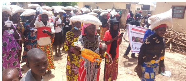
Cross-section of beneficiaries during the distribution of improved seeds and vegetables for planting

address food insecurity, water, sanitation and hygiene (WASH), nutrition, and protection needs.