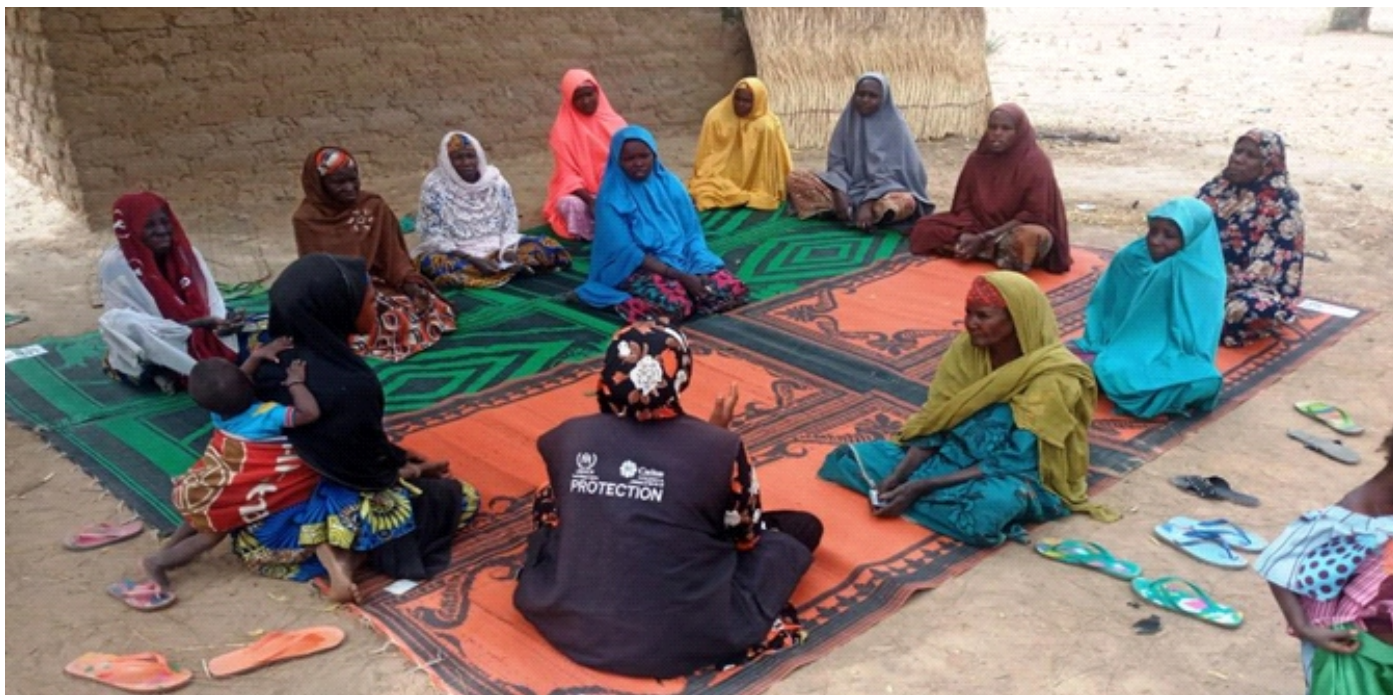
Sensitization on the importance of education in Maiha, Adamawa State