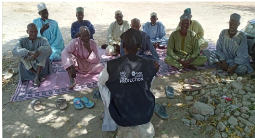
An interactive session on the effects of domestic violence in Gujba, Yobe State

The Protection Unit of Caritas Nigeria works to improve the protection, dignity, and well-being of internally displaced persons (IDPs) and Returnees in Nigeria. In the year under review, the Unit, with the support of the United Nations High Commissioner for Refugees (UNHCR), implemented three projects across Adamawa, Borno, Cross River, Edo, and Yobe States as follows: