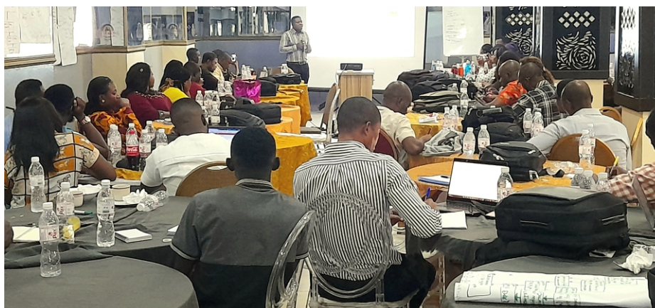
PMD Pro training session with Caritas Nigeria Staff in Imo State