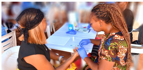
HIV testing service at St. JohnMary Vianney Parish in Asaba, Delta State