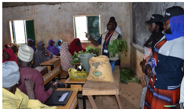
Training on sensitive agricultural climate-smart home gardening practices in Yamarkumi community, Biu LGA of Borno State

agricultural inputs, building their capacity on best agronomic practices which are climate-smart inclined to increase farm yields, as well as providing selected households with eco-friendly stoves. The project has the following activities for the year 2023; partners mapping, community identification and selection, community entry visit and stakeholder engagement, identification of enumerators, identification of community mobilizers, identification and formation of Community Project Implementation Committee (CPIC) groups, and advocacy for the provision of five demonstration farms.