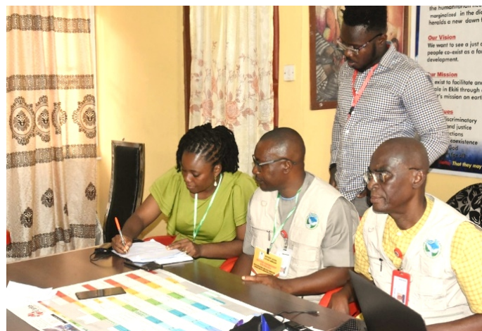
Caritas Nigeria and JDPC Ekiti team participate in the Situation Room of the Ekiti State Governorship Elections