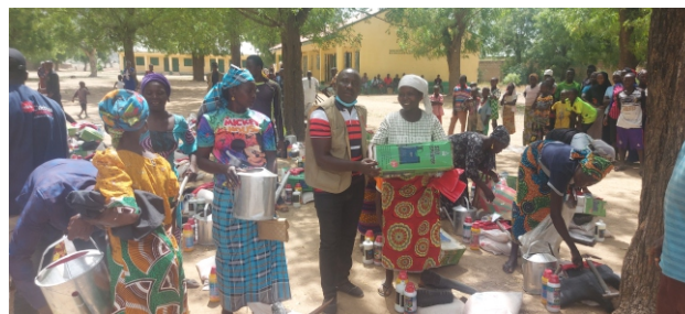
Distribution of farm inputs to persons of concern in Mildo Community, Madagali LGA of Adamawa State