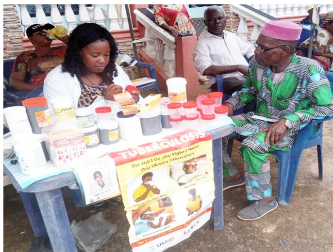
TB Screening at Nkwerre LGA of Imo State

Since 2020, Caritas Nigeria has co-implemented the Global Fund-supported Public Private Mix Tuberculosis project with the Institute of Human Virology Nigeria (IHVN). Currently, the project is implemented in 550 public-private Mix facilities spread across Ebonyi, Enugu and Imo States. Targeting private facilities, Caritas Nigeria adopts the HUB and Spoke models to carry out active tuberculosis (TB) case-finding. Whereas the HUBs are the facilities while the Spokes are the informal health sectors like patent medicine vendors, traditional birth attendants (TBAs), and religious and other healing homes. Project activities carried out with a focus on community tuberculosis testing included house-to-house TB case-finding, targeted outreaches, contact tracing of index cases, TB screening at herbal homes, TBAs and traditional child clinics, and TB screening in religious settings.