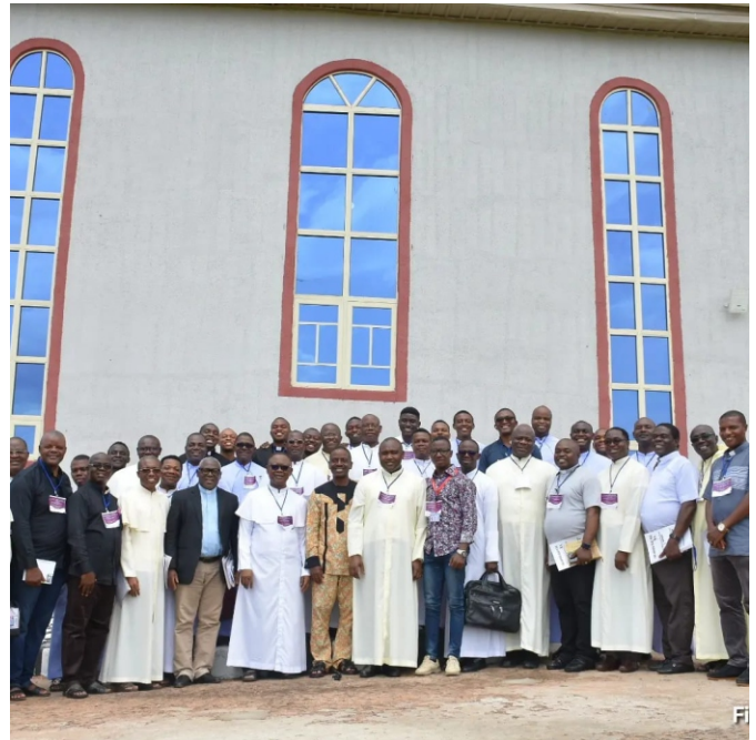
Participants at the CRS-supported workshop on Collaboration for Visioning for Awka Diocese in Anambra State