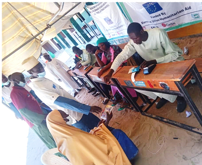
Disbursement of cash grants to representatives of vulnerable households in Borno State

The ECHO SAHaRA project is a humanitarian program aimed at providing food and water assistance to internally displaced people (IDPs) and host communities in Kaga and Magumeri LGAs of Borno State. The project's objective was to improve the living conditions and dignity of those affected by armed conflict in the area. The approach is community-based and participatory, with an emphasis on empowering beneficiaries and working with faith-based leaders to spread conflict prevention messages.