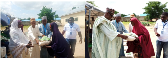
Persons of concern in Bama LGA of Borno State receive agricultural inputs for planting

In 2022, Caritas Nigeria partnered with the Food and Agriculture Organization (FAO) to address the livelihoods and food security of individuals affected by the crisis in northeast Nigeria. The program targeted 4,826 households in Bama and Gwoza local government areas (LGA) of Borno State and enhanced the population's capacity to cope with the Boko Haram crisis.