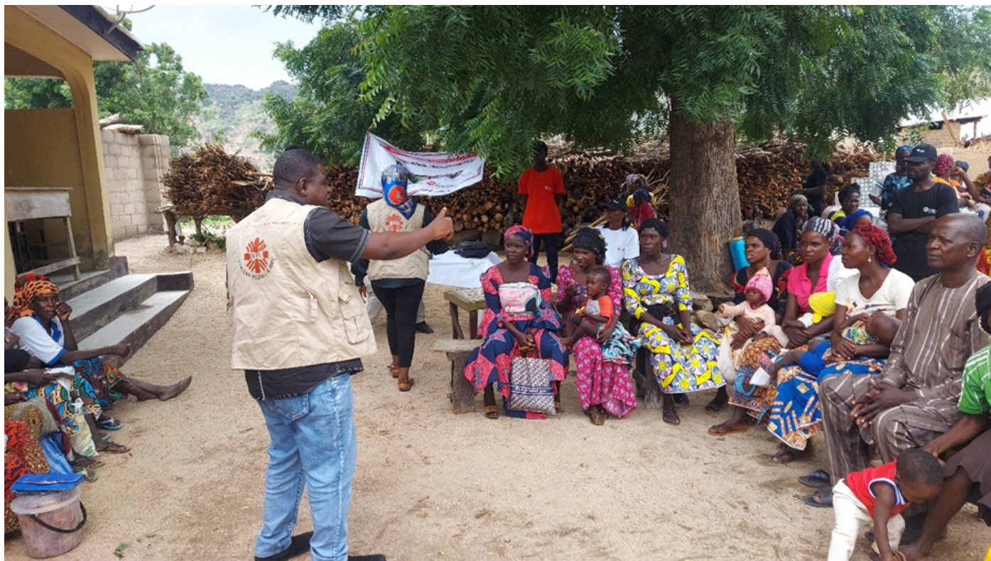
A sensitization session in one of the project communities

Through Caritas Norway, the Norwegian Ministry of Foreign Affairs is funding a humanitarian program to provide emergency food assistance and protection to 5,000 conflict-affected, vulnerable persons in Adamawa and Borno States in Northeast Nigeria. Implemented by Caritas Nigeria, the program reached out to the targeted populations in six (6) LGAs of Borno and Adamawa states as follows; Michika and Madagali (in Adamawa state), and Askira Uba, Biu, Gwoza and Kaga LGAs (in Borno state), to