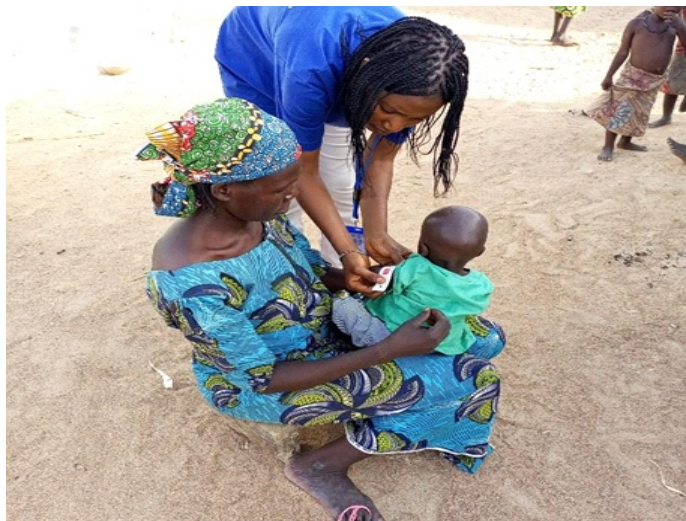
A Caritas Nigeria staff measures the mid-upper arm circumference (MUAC) of a child formerly diagnosed with severe acute malnutrition in Camp D, Gwoza LGA of Borno State

The German Federal Foreign Office-funded project aims to reduce the impact of conflict-related food insecurity and improve the protection of the most vulnerable groups affected by the Lake Chad crisis in Northeast Nigeria, Northern Cameroon and Chad. The project, which is in its second phase, achieved its aims and objectives through food security, protection and nutrition-focused approaches, with a focus on Borno and Adamawa states in Nigeria.