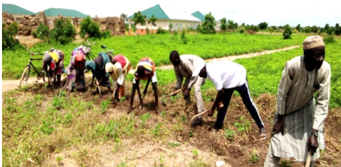
A practical session (farmer field school) on good agricultural practices in Bama LGA of Borno State

In 2022, Caritas Nigeria partnered with the Food and Agriculture Organization (FAO) to address the livelihoods and food security of individuals affected by the crisis in northeast Nigeria. The program targeted 4,826 households in Bama and Gwoza local government areas (LGA) of Borno State and enhanced the population's capacity to cope with the Boko Haram crisis.