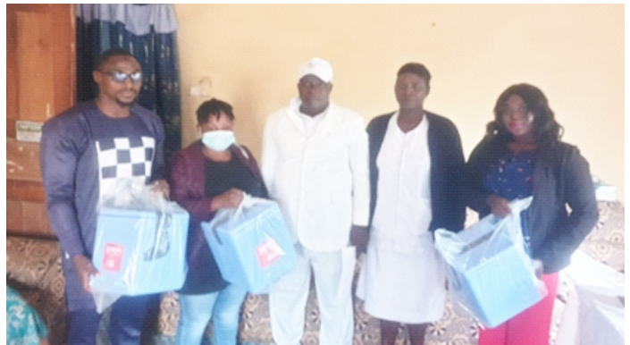
A man is administered the COVID-19 vaccine on his farmland Distribution of cold boxes to Comprehensive Health Centre, Jos

COVID-19 vaccination data from project communities in Kaduna, Plateau, and Rivers States