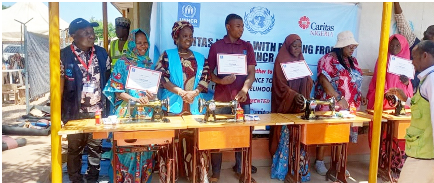
People of concern, who completed the tailoring component of vocational skills training in the Njabore community, Yola North LGA of Adamawa State, pose with their certificates and start-up kits