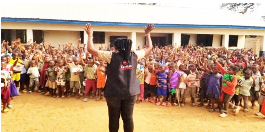
Age-appropriate sensitization of school children on Child Protection & Abuse at St Peters 1, Adagom in Ogoja