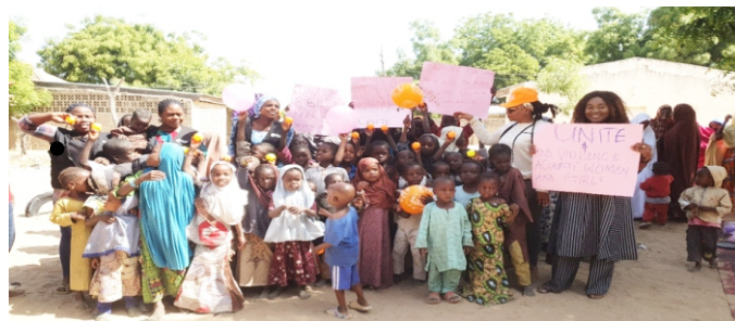
The project team with children in the displaced persons camp in Gubio, Maiduguri Metropolitan Council

To improve the protection and psychosocial well-being of children in Bama, Monguno, Banki & Maiduguri local government areas of Borno State, Caritas Nigeria deployed the following strategies: