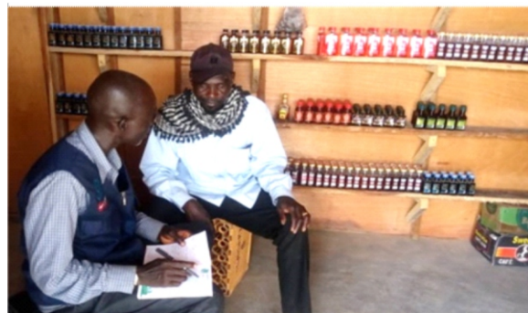
A monitoring visit to the store of a person of concern who received a cash grant in Vuragwadla in Madagali LGA

Conducting market viability assessments and supporting field workers to conduct targeted sensitization increased the synergy between Caritas and community leaders