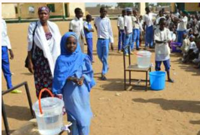
Hygiene and sanitation training for IDP children in Yobe State.

Emergency/Early Recovery Support to IDPs in the FCT affected by Boko Haram Insurgency: this project has two very key components; WASH and Livelihood/Food Security. The total households reached were 160 IDP Households including another 129 host community households.