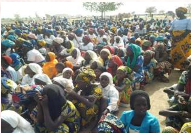
A cross section of Nigerian Refugees in Maroua, Cameroun that were supported by Caritas Nigeria.

Catholic Bishops' Conference of Nigeria (CBCN) support to IDPs: between February and July