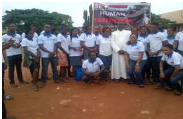
Anti-human trafficking campaign in Uromi.