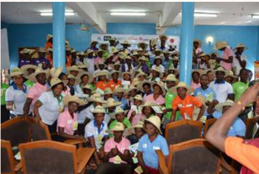
Youths and Women trained and empowered in Onitsha.