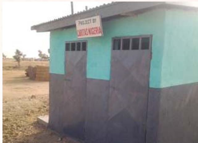
One of the toilets built by Caritas Nigeria in Maroua camp, Cameroun.

2015, The Catholic Bishops' Conference of Nigeria supported Caritas Nigeria to address basic needs of 10,000 Internally Displaced Persons in the dioceses of Maiduguri, Yola, Bauchi, Zaria, Katsina Ala, Jalingo, and Jos. Furthermore, the support was extended to the Bishops Conference of Cameroun and the Diocese of Maroua, Cameroun to enable the diocese address food and Non-food needs of Nigerian refugees in Cameroun. Cooking utensils, condiments, hygiene items, bedding and mosquito nets were distributed to the refugees. Also 15 toilets with four compartments each were built for the refugees.