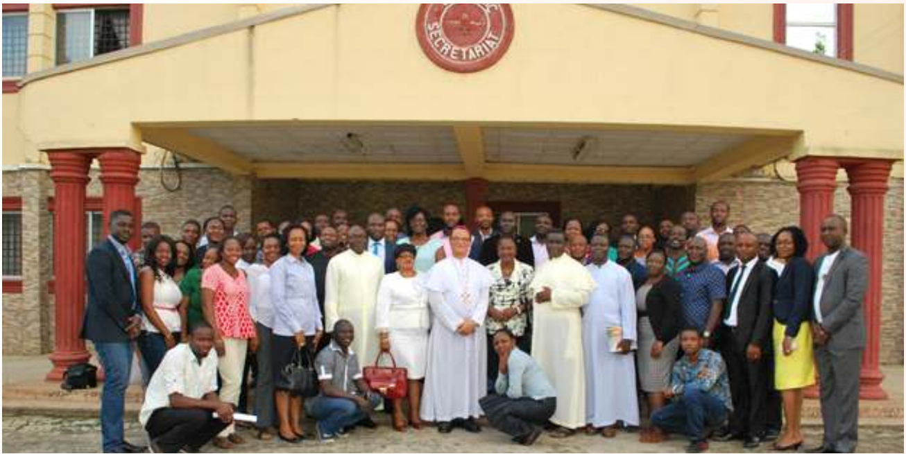
"We are Caritas" Caritas Nigeria Staff, Abuja Region with members of the Board of Directors