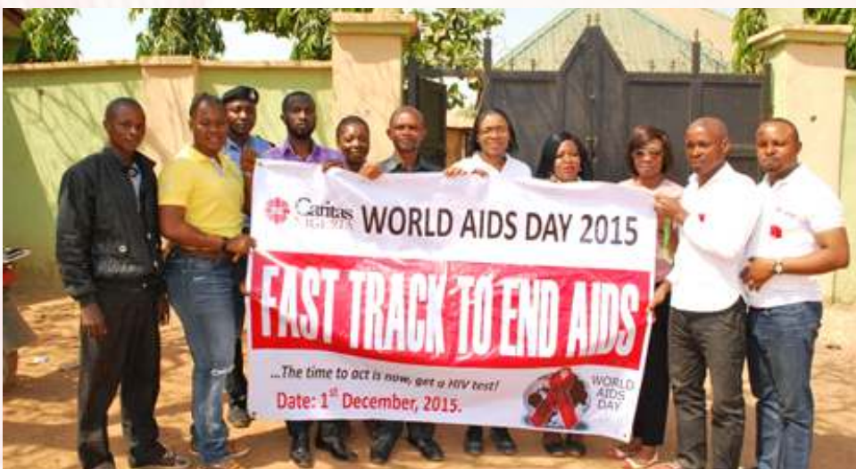
One of the Caritas Nigeria teams during the World AIDS Day 2015, sensitization and testing outreach.

World AIDS Day: Caritas Nigeria commemorated the World AIDS Day in December, 2015 with special focus on communities and partner health facilities and CBOs in the “scale-up” LGAs in FCT-Abuja and Benue State. Caritas Nigeria communicated with JDPCs, Parish Priests and community leaders to sensitize their people on the persistent HIV/AIDS prevalence and also encourage them to access HIV testing and counseling services to know their status. As part of the week-long activities, commemorative mass was held in the Catholic Secretariat and the SUSTAIN officers worked in Kabusa, Jikwoyi, Kubwa (FCT) as well as in Benue State to give over 1,400 persons the opportunity to know their HIV status.