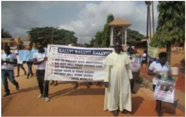
Peace Rallies across the Archdiocese.

Peace Rally: rallies were conducted across the diocese to promote messages on peace during the