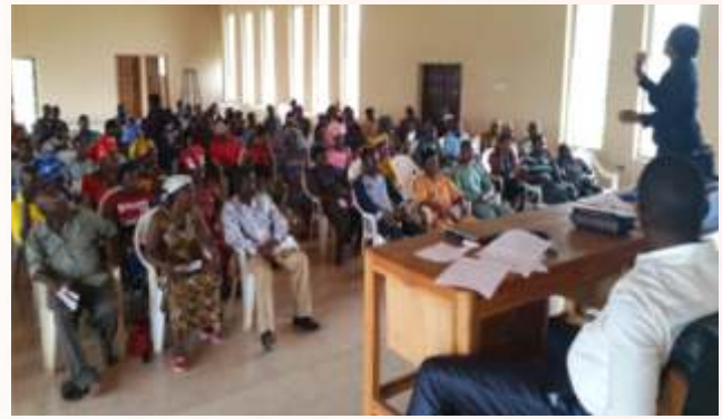
A cross section participants at the congress with Caritas Nigeria Anti HT Desk officer at the awareness creation meeting on Human Trafficking in Uromi, Esan North East L.G.A

feast day (February 8 th ) of St. Josephine Bahkita, a Sudanese-born former slave who became a Canossian Religious Sister in Italy. Caritas Nigeria marked this day through; media campaigns against trafficking in persons, enlightenment campaigns in Parishes by Priests to create awareness of these vices in over 1,072 Parishes across 36 states and FCT.