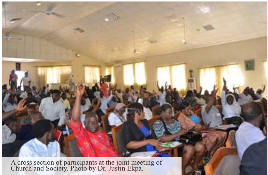
A cross section of participants at the joint meeting of Church and Society.

Notably, two of the meetings of the Province were used as platform to espouse coordinators understanding of the provisions of the National Health Act (An Act to promote a framework for the Regulation, Development and Management of a National Health system and set standards for Rendering Health Services in the Federation and