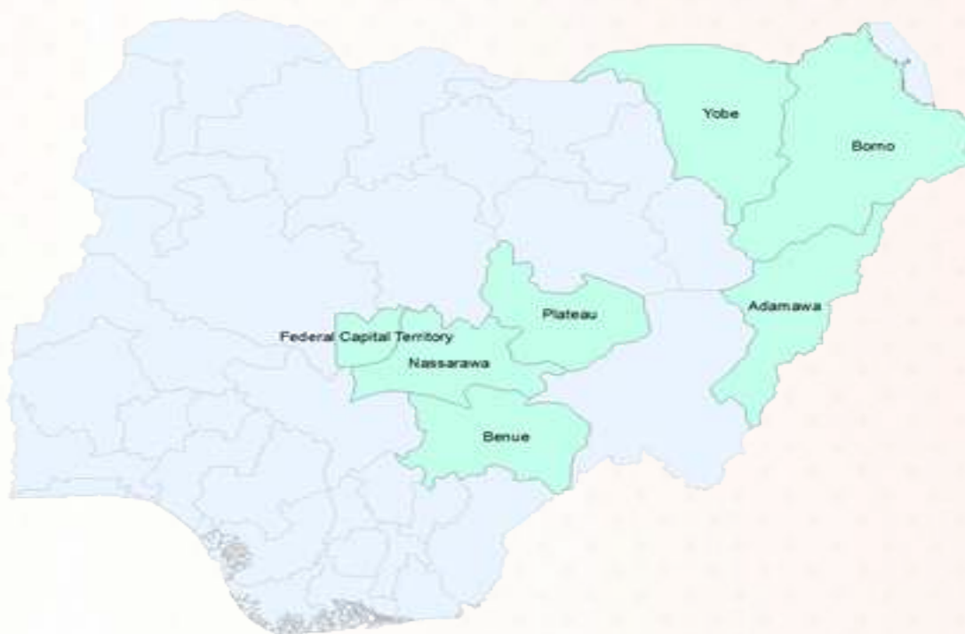
States supported for Emergency Response and Humanitarian