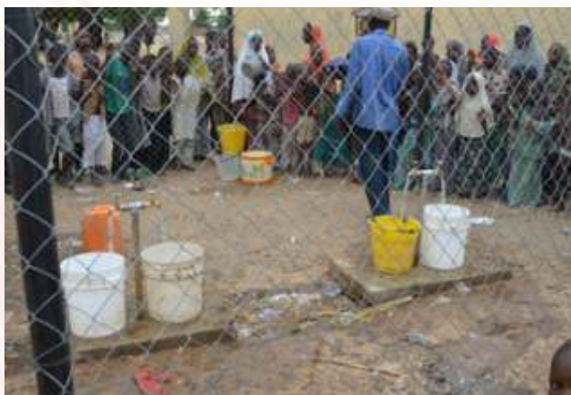
Some water points constructed in Yobe State.

UNICEF PCA PROJECT TO SUPPORT IDPS IN YOBE STATE: Integrated Humanitarian Assistance for North East Nigeria: Caritas Nigeria implemented the WASH component of this project through distribution of basic water treatment, dignity and hygiene kits to 5,823 IDP Households and host families in addition to the construction of 81 emergency latrines, rehabilitation of 38 water points at school and community Centre sheltering IDPs and training of 42 Community volunteers on Hygiene promotion, water treatment, water storage and handling as well as promoting hygiene amongst the IDPs on bodily and menstrual hygiene, handwashing at critical times to prevent diseases. This project was supported by UNICEF to respond to appalling Water and Sanitation condition of the IDPs in Yobe state, the project was implemented from January to June, 2015.