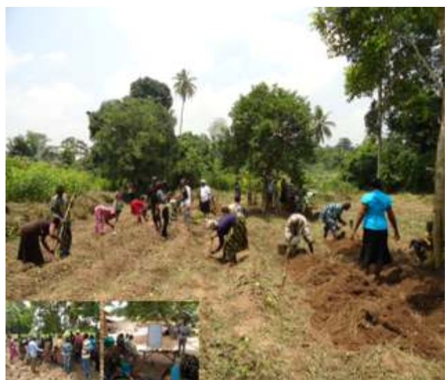
Beneficiaries of the Agricultural and livelihoods intervention of the Province.