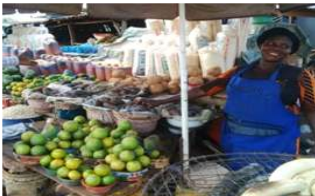
A beneficiary of the Micro-Credit Scheme to improve household economy.